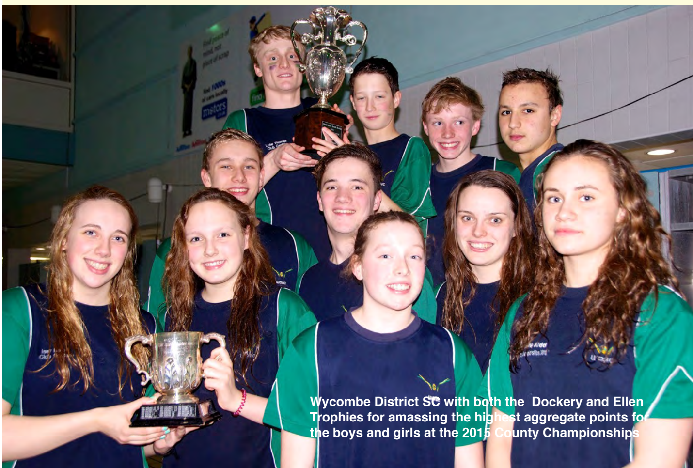
Wycombe District SC with both the Dockery and Ellen Trophies for amassing the highest aggregate points for the boys and girls at the 2015 County Championships